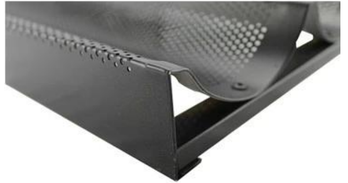
Aluminum alloy simple frame