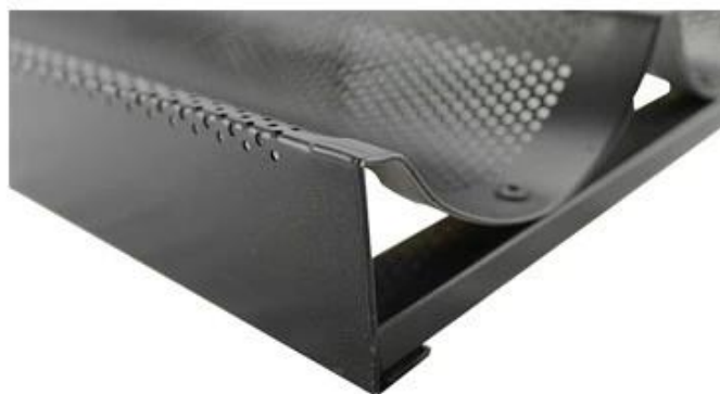
Aluminum alloy simple frame