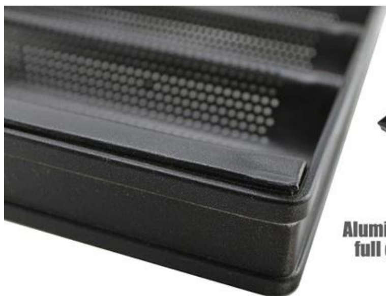
Aluminum alloy full envelope