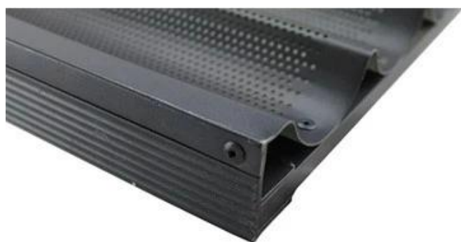
Aluminum alloy strengthening frame