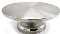
Stainless Steel Rotating Cake Stand