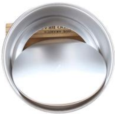
Round Cake Pan(Detachable,Anodized)