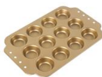
12-mold Cupcake Pan(Carbon Steel)