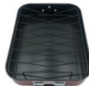
Chicken Roasting Pan with Rack(Carbon Steel)