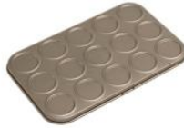
15-mold Macaroon Cake Pan(Carbon Steel)