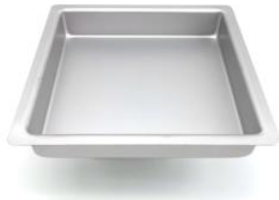
Square Cake Pan(Fixed,Anodized)