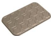
Flower Macaroon Cake Pan(Carbon Steel)