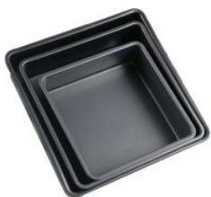
Square Cake Pan(Carbon Steel,Fixed)