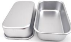
Rectangle Cake Pan(Anodized)