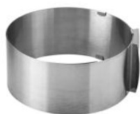
Adjustable Round Mousse Ring