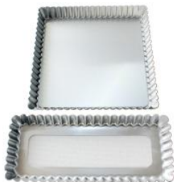
Fluted Tart Pan (Aluminium, Anodized)