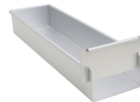
Tiramisu Cake Mold(Anodized)