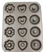
12-mold Flower Donut Pan(Carbon Steel)