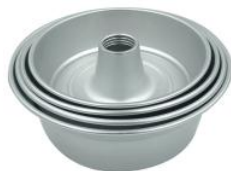
Tube Cake Pan(Fixed,Anodized)