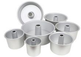
Deep Tube Cake Pan(Detachable,Anodized)