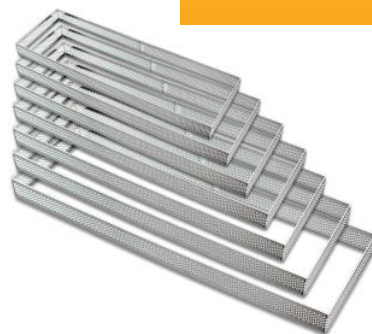
Rectangle Perforated Tart Ring