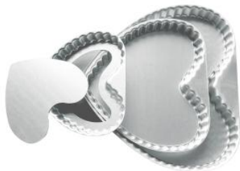
Heart Fluted Tart Pan (Aluminium, Anodized)