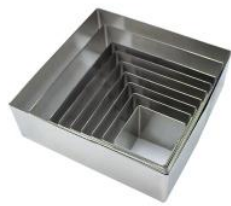
Square Mousse Ring