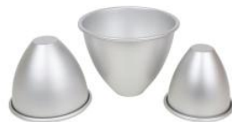
Princess Dress Cake Mold (Fixed,Anodized)