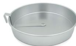
8" Cake Pan(Anodized)