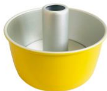
Colorful Tube Cake Pan(Detachable,Anodized)