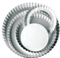
Round Fluted Tart Pan (Aluminium, Anodized)