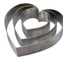
Heart Shape Mousse Ring