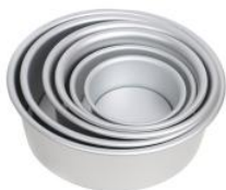
Round Cake Pan(Fixed,Anodized)