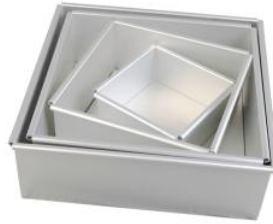
Square Cake Pan (Fixed,Anodized)