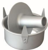
Tube Cake Pan(Detachable,Anodized)