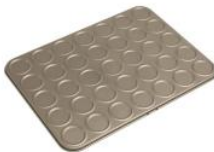
35-mold Macaroon Cake Pan(Carbon Steel)