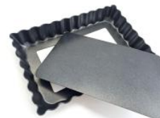
Rectangle Tart Pan (Carbon Steel)