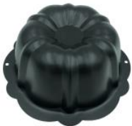
Kugelhopf Cake Mold(Carbon Steel)