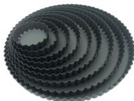
Fluted Tart Pan (Aluminium, Non Stick)