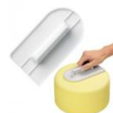
Cake Cream Smoother