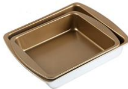
Square Cake Pan with Handle(Non-stick)