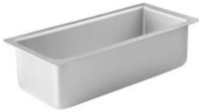
Rectangle Cake Pan(Fixed,Anodized)