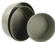
Round Cake Pan(Carbon Steel,Fixed)