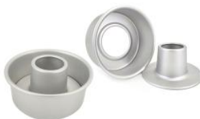
4.5" Tube Cake Pan(Detachable,Anodized)