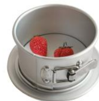
Soldier Buckle Cake Mold(Stainless Steel)