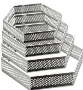
Hexagon Perforated Tart Ring