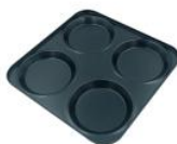
4-mold Pancake Pan(Carbon Steel)