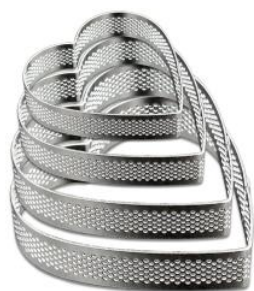
Heart Perforated Tart Ring