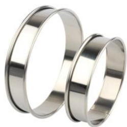
Round Tart Ring Rolled Edge