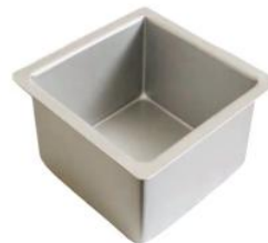
Square Deep Cake Pan(Fixed,Anodized)