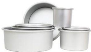
Round Deep Cake Pan(Fixed,Anodized)