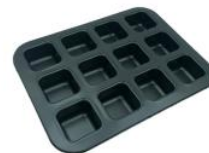
12-mold Square Cupcake Pan(Carbon Steel)