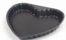
Heart Tart Pan (Carbon Steel, Detachable)