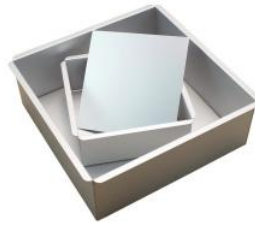
Square Cake Pan(Detachable,Anodized)