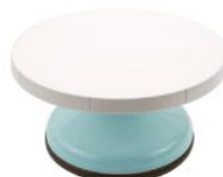
Plastic Rotating Cake Stand