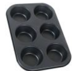
6-mold Cupcake Pan(Carbon Steel)