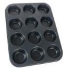
12-mold Cupcake Pan(Carbon Steel)