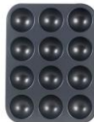
12-mold Half-ball Cake Pan(Carbon Steel)