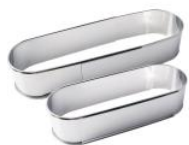
Adjustable Oval Mousse Ring