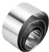
Round Mousse Ring