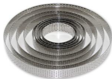
Round Perforated Tart Ring