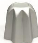
Eight-pointed Cake Mold(Fixed,Anodized)