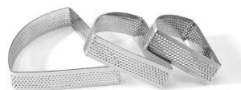
Fan-shaped Perforated Tart Ring