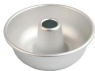
Tube Cake Pan(Fixed,Anodized)