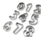
Cookie Ring Mold Set