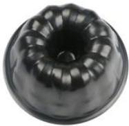
Kugelhopf Cake Mold(Carbon Steel)