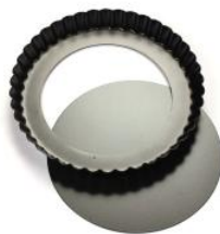
Round Tart Pan (Carbon Steel, Detachable)