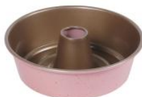
Tube Cake Pan(Fixed,Non Stick)