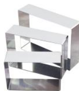
Rectangle Mousse Ring