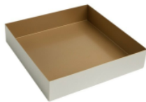
Suqare Cake Pan(Fixed,Anodized)