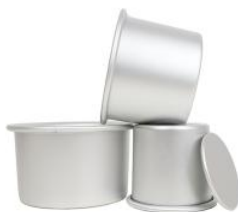
Round Deep Cake Pan(Detachable,Anodized)