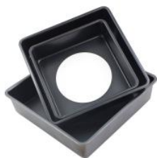
Square Cake Pan(Carbon Steel,Detachable)