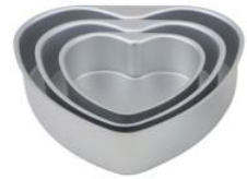
Heart Shaped Cake Pan(Fixed,Anodized)