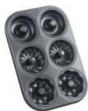
6-mold Donut Pan(Carbon Steel)