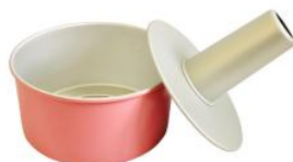
Colorful Tube Cake Pan(Detachable,Anodized)