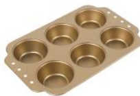
6-mold Cupcake Pan(Carbon Steel)