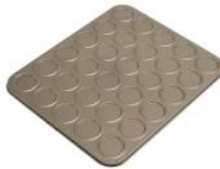
30-mold Macaroon Cake Pan(Carbon Steel)