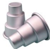
Cake Pudding Mold (Fixed,Anodized)