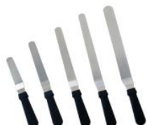
Cake Spatula With PP Handle