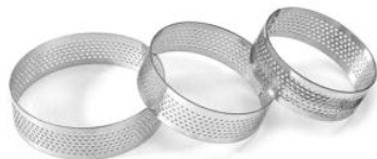
Round Perforated Tart Ring