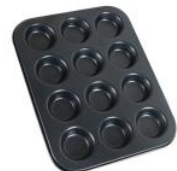
12-mold Cupcake Pan(Carbon Steel)