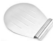
Cake Transfer Shovel