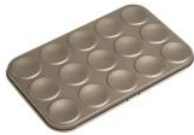
Arc Macaroon Cake Pan(Carbon Steel)