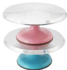
Aluminum Rotating Cake Stand