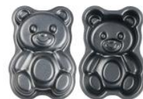
Bear Cake Cookie Mold(Carbon Steel)