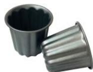
Canele Mold(Carbon Steel)