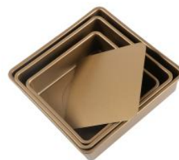
Square Cake Pan(Carbon Steel,Detachable)