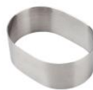
Oval Cheese Ring Mold