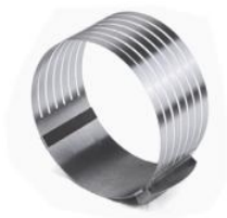
Adjustable Cake Slicer