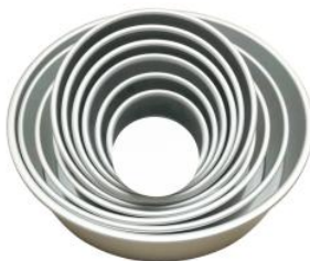
Round Cake Pan(Detachable,Anodized)