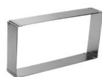
Adjustable Square Mousse Ring