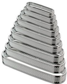
Oval Perforated Tart Ring