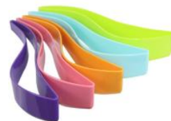
Plastic Cake Cutter