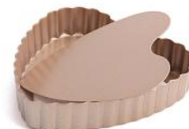
Heart Tart Pan (Carbon Steel)