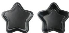
Star Cake Mold(Carbon Steel)