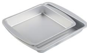
Square Cake Pan with Handle(Anodized)