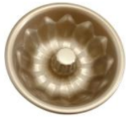
Kugelhopf Cake Mold(Carbon Steel)