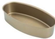
Cheesecake Mold(Carbon Steel)