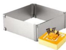
Adjustable Square Mousse Ring