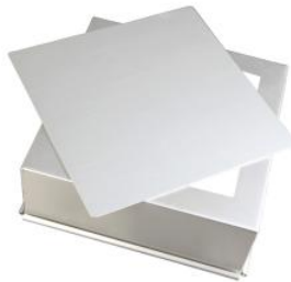
Square Cake Pan(Detachable,Anodized)