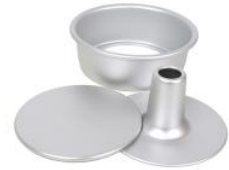
Tube Cake Pan(Detachable,Anodized)