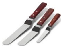
Spatula With Wood Handle