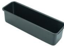
Rectangle Cake Bread Mold(Carbon Steel)