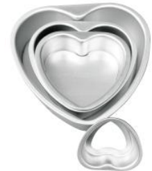
Heart Shaped Cake Pan(Detachable,Anodized)