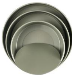
Round Cake Pan(Carbon Steel,Detachable)