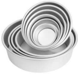
Round Cake Pan(Fixed,Anodized)