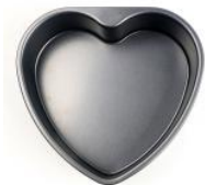
Heart Shape Cake Mold(Carbon Steel, Fixed)