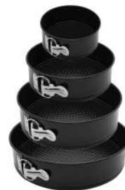
Springform Cake Pan(Carbon Steel)