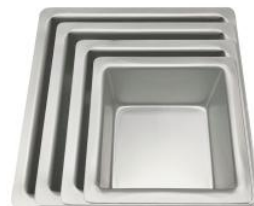
Square Cake Pan(Fixed,Anodized)